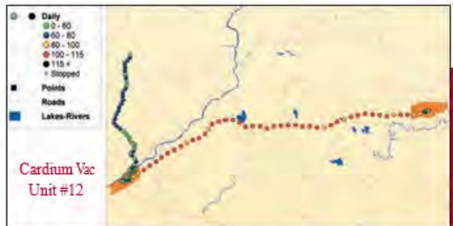
Satellite Monitored Road Speeds

As Acknowledged Through Partnerships In Health & Safety